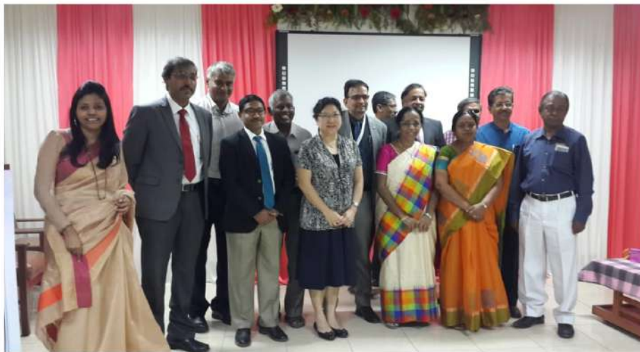
CME on OCULOPLASTY (Bicentenary celebrations of RIOGOH) program, at RIOGOH, 15 th July 2018