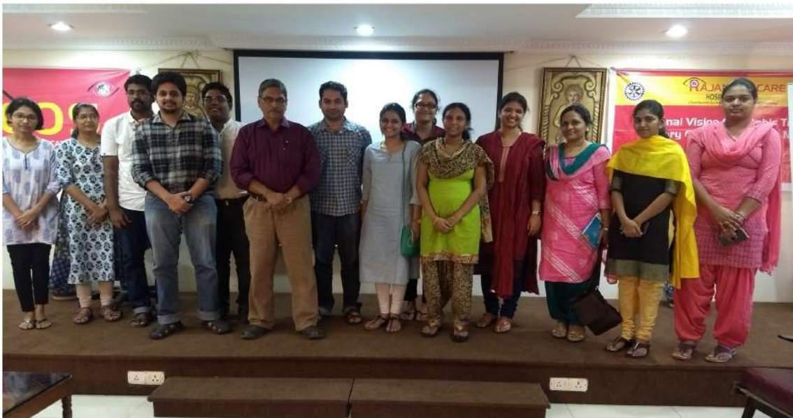
PG CATALYST PROGRAM at Rajan Eye Care Hospital Pvt Ltd, Chennai on Sunday, 8 th April 2018

The TNOA ARC has conducted the following CME programs.