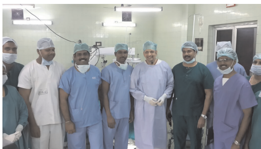
Tanjavur Live Surgery